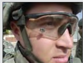
Lt. A's eyesight was saved by the Sawfly System