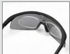
Optional Rx Carrier