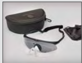
U.S. Military Kit